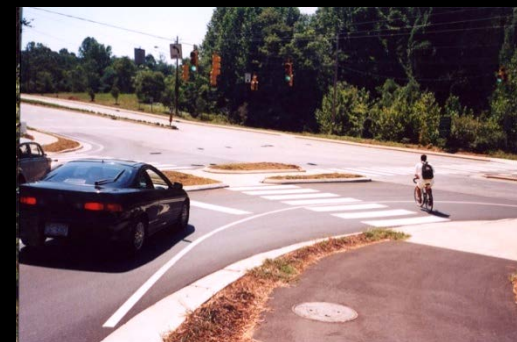
W.T. Weaver Greenway - Asheville

All citizens of NC and visitors to the state will be able to walk and bicycle safely and conveniently to their chosen destinations with reasonable access to roadways.