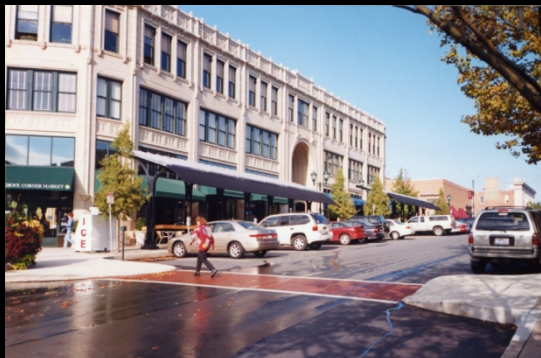
Asheville Ped Xing