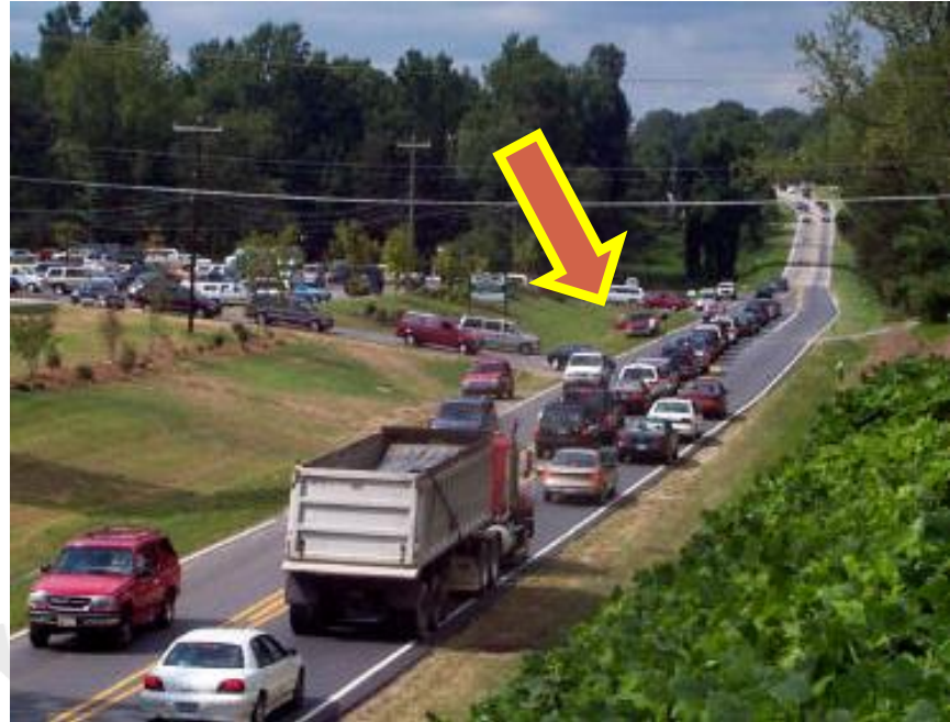
Municipal & School Transportation Assistance