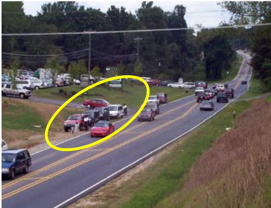
Municipal & School Transportation Assistance